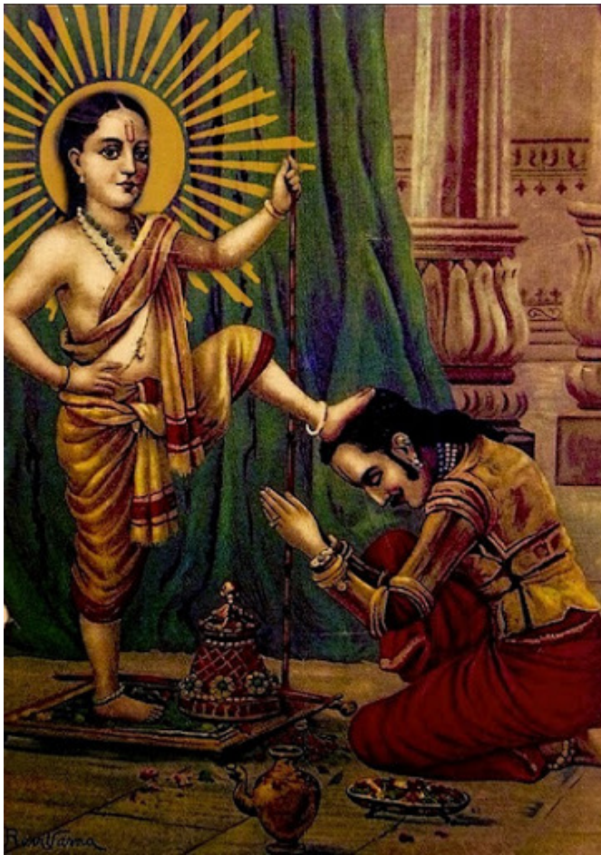
LORD VAMANADEVA BEGS CHARITY FROM BALI MAHARAJA Sriḷa Sukadeva Goswami

When the Supreme Personality of Godhead, Vamanadeva, heard Bali Maharaja speaking in this pleasing way, He was very satisfied, for Bali Maharaja had spoken in terms of religious principles. For this reason, the Lord began to praise him.